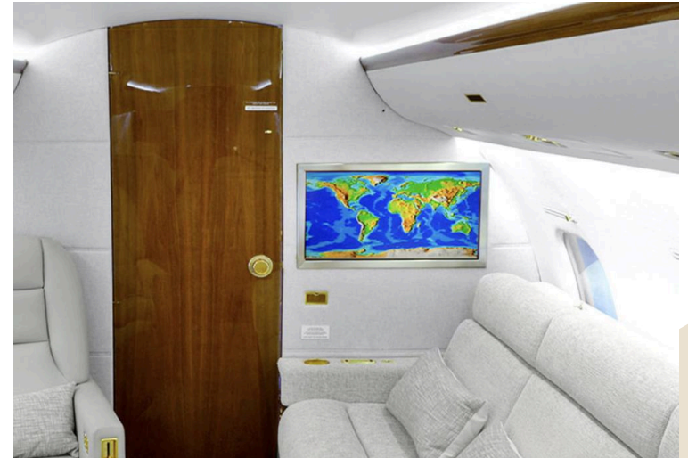
Aft 26" LCD Monitor